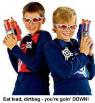
Eat lead, dirtbag - you're goin' DOWN!

Monday to Friday - 9:00 am to 4:30 pm All Campers MUST arrive no later than 9:30 am. (Early care 8:00 am (no charge)/ Extended Care available to 6:00 pm $15 additional per day)